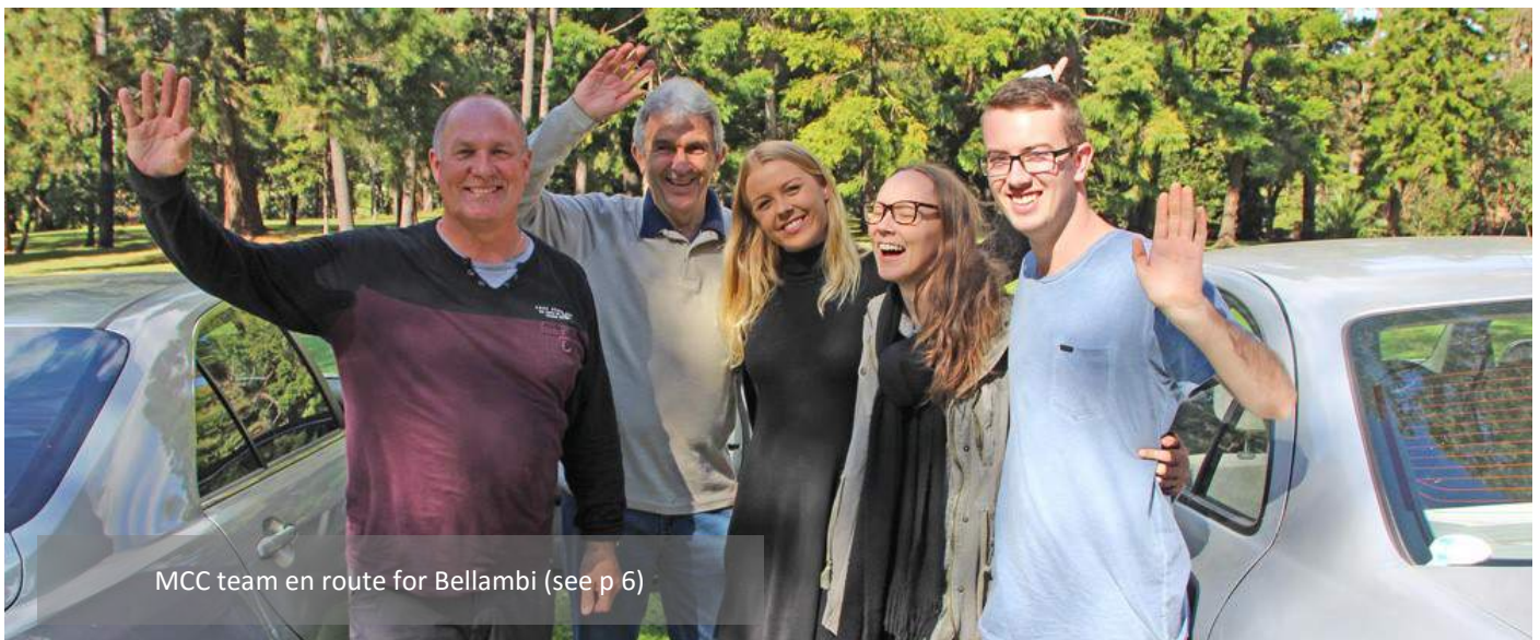
MCC team en route for Bellambi (see p 6)